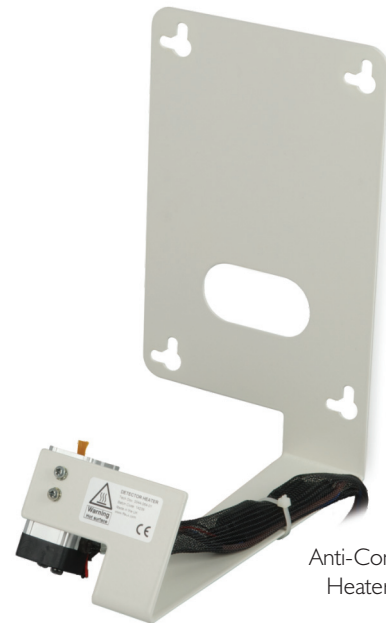
Anti-Condensation Heater Bracket