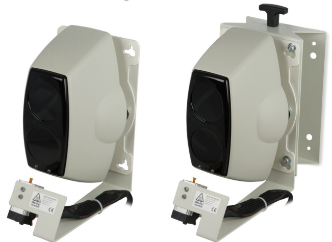
Anti-Condensation Heater with Detector